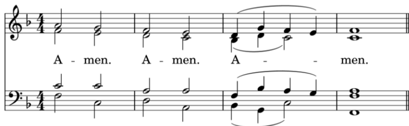
Danish Amen Mass

in the unity of the Holy Spirit, to you be honor, glory, and praise, for ever and ever.