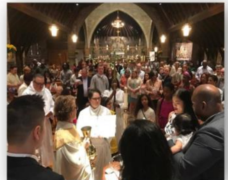
Christ Church, Bloomfield & Glen Ridge, NJ, Diocese of Newark. Celebrating a baptism.