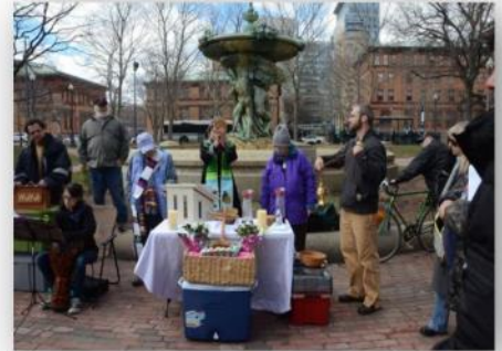
Church Beyond the Walls, Providence, Diocese of Rhode Island. Censing the altar during the Eucharist.

Almighty God, who through your only-begotten Son Jesus Christ overcame death and opened to us the gate of everlasting life: Grant that we, who celebrate with joy the day of the Lord’s resurrection, may be raised from the death of sin by your life-giving Spirit; through Jesus Christ our Lord, who lives and reigns with you and the Holy Spirit, one God, now and forever. Amen.