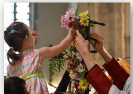
St. Paul's Episcopal Church, Duluth, Episcopal Church in Minnesota. Flowering the cross.